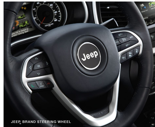
JEEP® BRAND STEERING WHEEL

* Chrysler estimated highway mpg. Final EPA mileage not available at time of publication. Use for comparison purposes only.