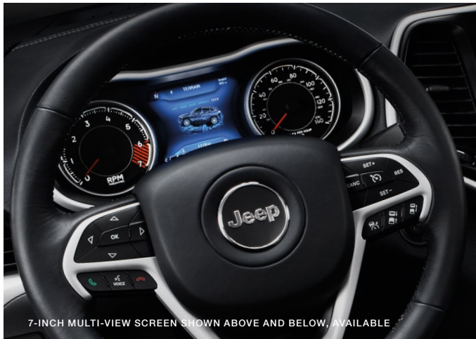
7-INCH MULTI-VIEW SCREEN SHOWN ABOVE AND BELOW, AVAILABLE