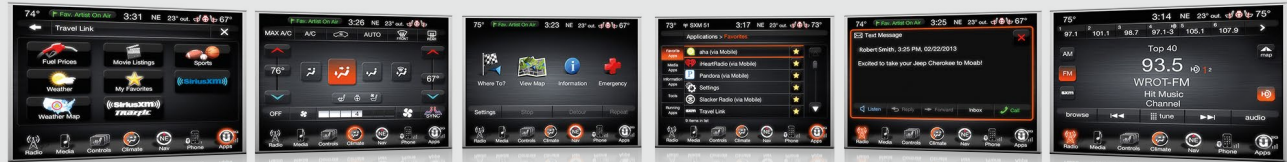
UCONNECT® 8.4-INCH COLOR TOUCH SCREENS

* Check uconnectphone.com for compatibility. **Service-enabled vehicle must be located in U.S. or Canada.