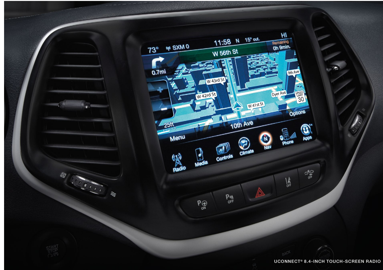
UCONNECT® 8.4-INCH TOUCH-SCREEN RADIO